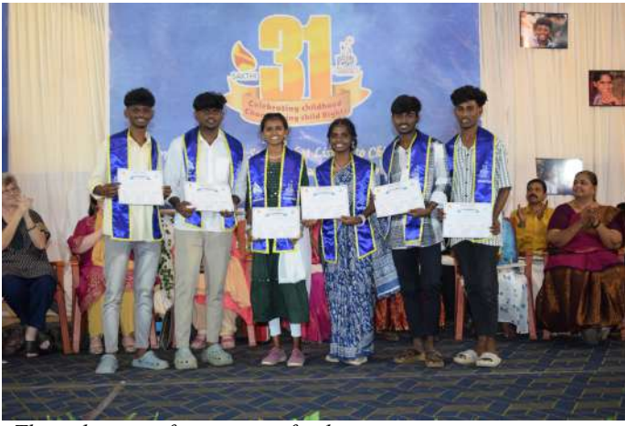
The induction of a new set of volunteers

Time spent with our individual sponsored children in their family homes remains a highlight for me from our visits. This time, a picture of our visit in 2023 was on display. For the older of my sponsored children our visit coincided with him preparing to fly from Madurai to Bopal to represent Vidiyal at a National event – something way beyond the expectations of those living in Melavasal.